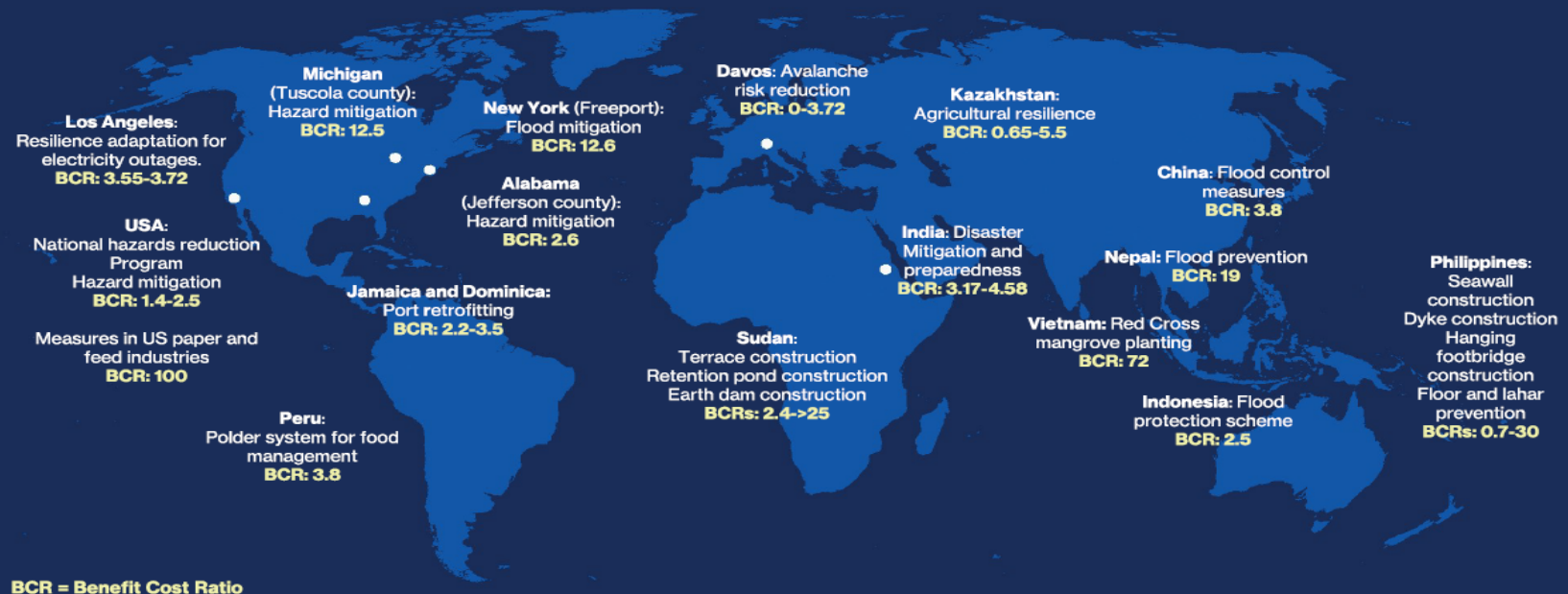
Figure 3: The benefit-cost ratio around the world

The benefit-cost ratio is a simple indicator which shows by how much the benefits of a project outweigh the costs. A ratio of 1:1 means the benefits equal the costs. The evidence demonstrates that preparing for disaster pays off; it generates a "resilience dividend". This dividend means that resilient infrastructure is an economically logical investment.