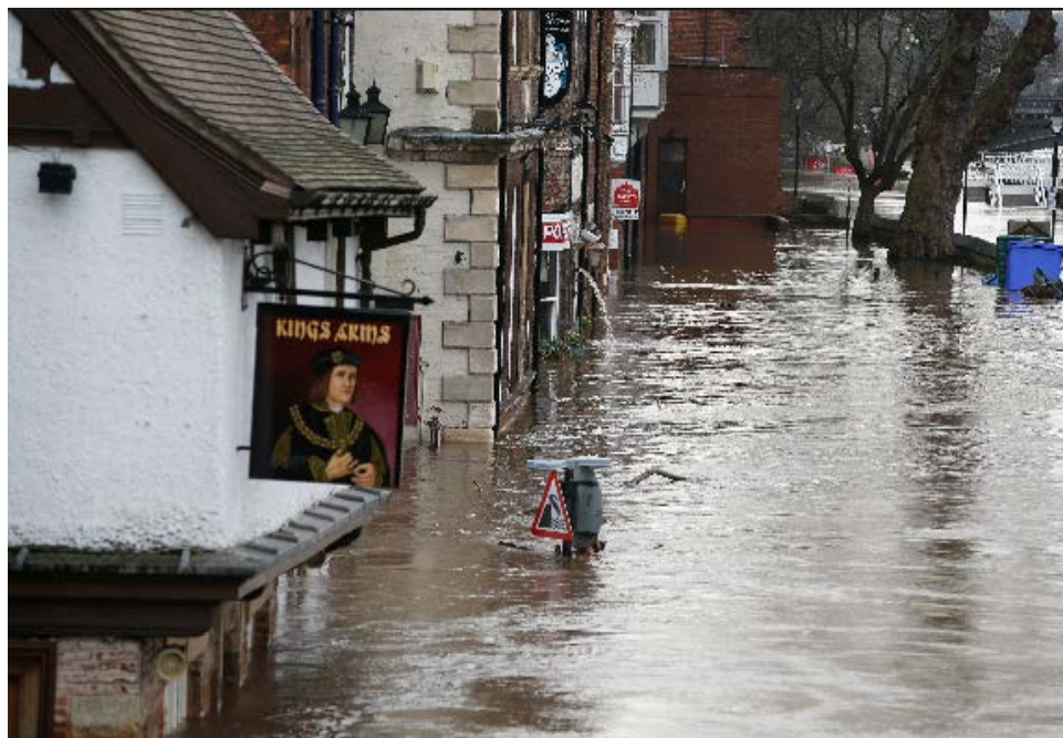
York, December 2015, after Storm Desmond