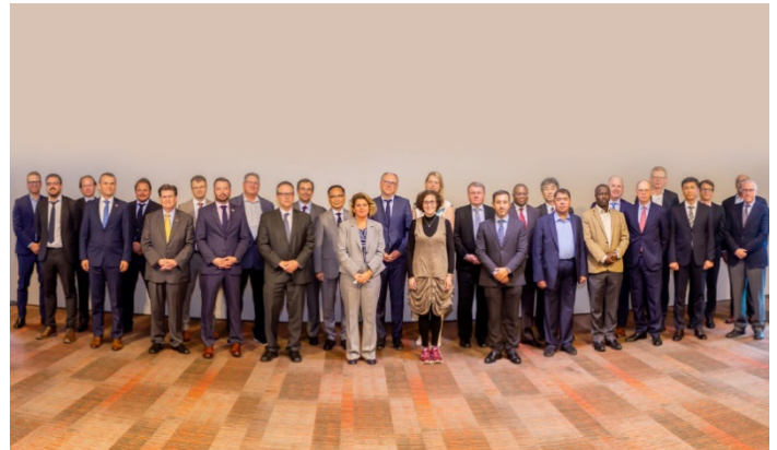
IAIS Executive Committee at 2022 Annual Conference in Santiago de Chile